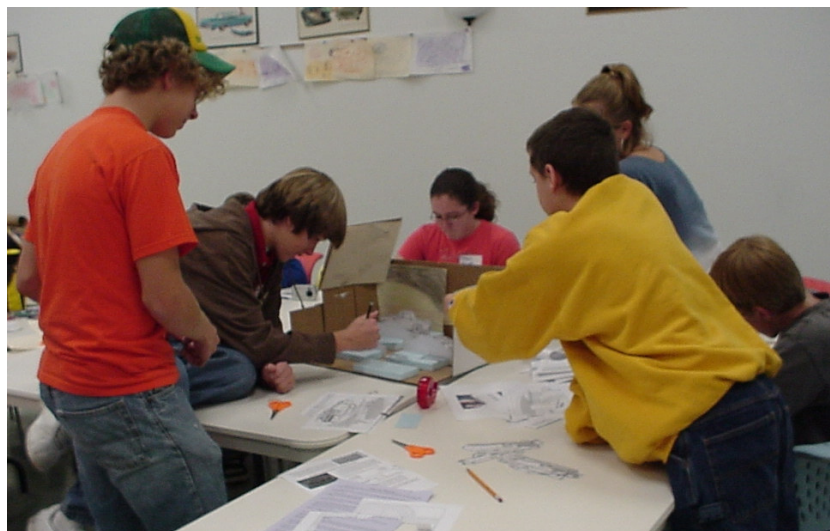
Independent group projects: Create your own Exhibit