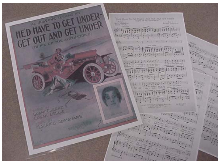
Automobile inspired sheet music