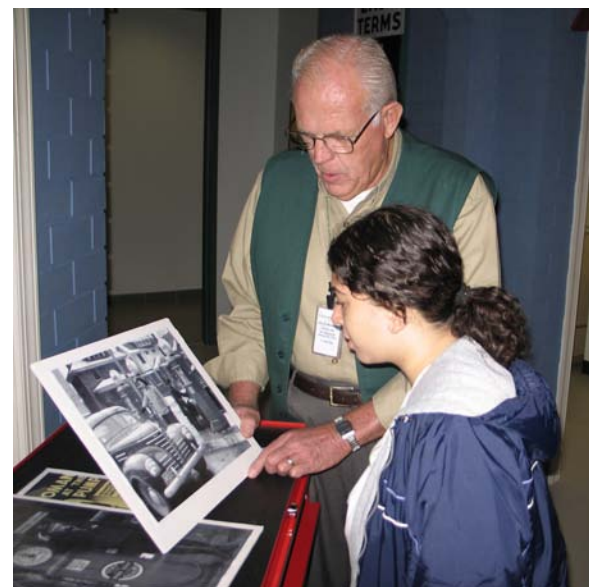
6 th grade student & Museum Explorer

Preschoolers on a gallery hunt using Miss Spider's “Eye Spy glasses”