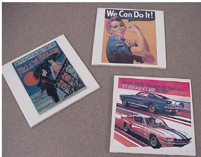
Car Tiles $3.00 surcharge fee