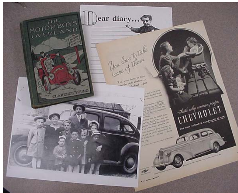
“Dear Diary” vintage automobile photographs inspire creative writing

Other Classroom Projects: Make Your Own Postcard; “Logo to Go” Make a paper VW Beetle, Vintage License Plate Rubbing; preschool age projects