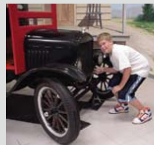
Interactive area for kids of all ages!

are also a variety of special short term and single day events that are added throughout the year such as various model car shows and CARNIVAL our one day annual festival that is a tribute to the motoring hobby. Be sure to call our check out our website for the latest information at aacamuseum.org .